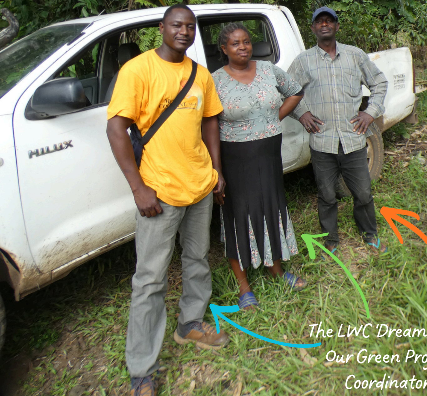
The LWC 'Dream Team' Our Green Project Coordinators

What feeds the animals also feeds families. Creating a cycle of care that benefits both people and wildlife.